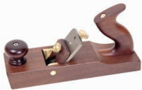
A55 Smoothing Plane $295.00* (10 in. long with a 2in. wide blade)

Well suited to final smoothing of any lumber surface, this 2.7 lb plane brings together the best of both wood and metal plane design. The “Norris Style” blade adjustment mechanism provides precision positioning for both depth and side-to-side movement. This smoothing plane would be a welcome addition to the tool kit of anyone working with hard and highly figured woods. The 55 degree bedding angle is an excellent choice for preventing tearout in difficult grain.