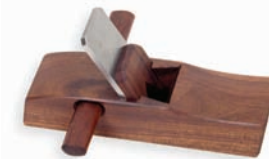
Palm Smoothing Plane $140.00* (5in. long with a 1-1/8in. wide blade)

Great for general purpose planing of small pieces lumber and can be easily used in one hand. Gidgee is a native Australian wood which is a member of the Acacia family. Wood is carefully selected, cut and dried to produce a stable and reliable tool capable of long service.