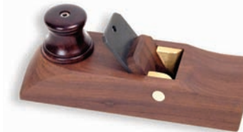
Block Plane $150.00* (6-7/8 in. long with a 1-1/2 in. wide blade)

is fully adjustable using a screw action mechanism, and it features comfortable handles, excellent balance, and minimal friction from the wood sole. This trying plane would be a welcome addition to the tool kit of anyone working with hard and highly figured woods. The 55 degree bedding angle is an excellent choice for preventing tearout in difficult grain.