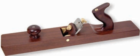
A55 Trying Plane $355.00* (18in. long with a 2in. wide blade)

Normally used for roughing work to remove the saw marks on sawn wood prior to flattening the board with a trying plane. An essential tool if you don't have a planing machine - it is well suited to general purpose planing of any lumber.