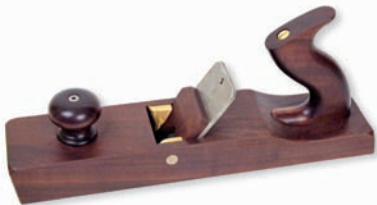
Aussie Jack Plane $225.00* (12 in. long with a 2in. wide blade)

Well suited to final smoothing of any lumber surface, this 2.7 lb plane brings together the best of both wood and metal plane design. The “Norris Style” blade adjustment mechanism provides precision positioning for both depth and side-to-side movement. This smoothing plane would be a welcome addition to the tool kit of anyone working with hard and highly figured woods. The 55 degree bedding angle is an excellent choice for preventing tearout in difficult grain.