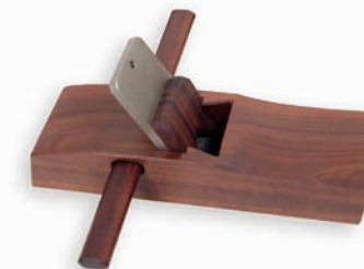
Smoothing Plane $195.00* (8-1/4in. long with a 2in. wide blade)

Perfect for final smoothing of any small timber surface.